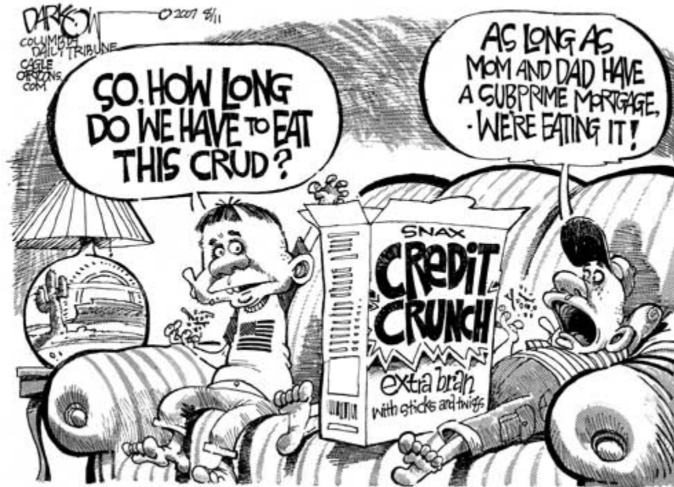
The above cartoon pokes fun at the lesser spending American's must endure as a result of the sub-prime mortgage crisis and shows how it will effect the family as a whole.